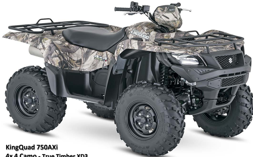
KingQuad 750AXi 4x4 Camo - True Timber XD3