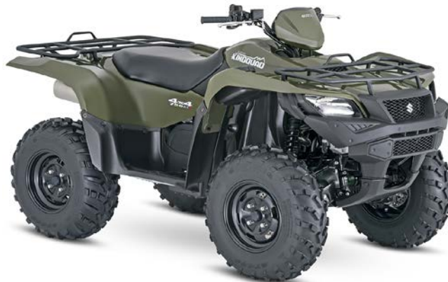
KingQuad 750AXi 4 x4 Terra Green