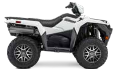
SOLID SPECIAL WHITE NO. 2 (KINGQUAD 750AXI POWER STEERING SE)

// Wider range of genuine Suzuki accessories lets you set up your KingQuad for any mission