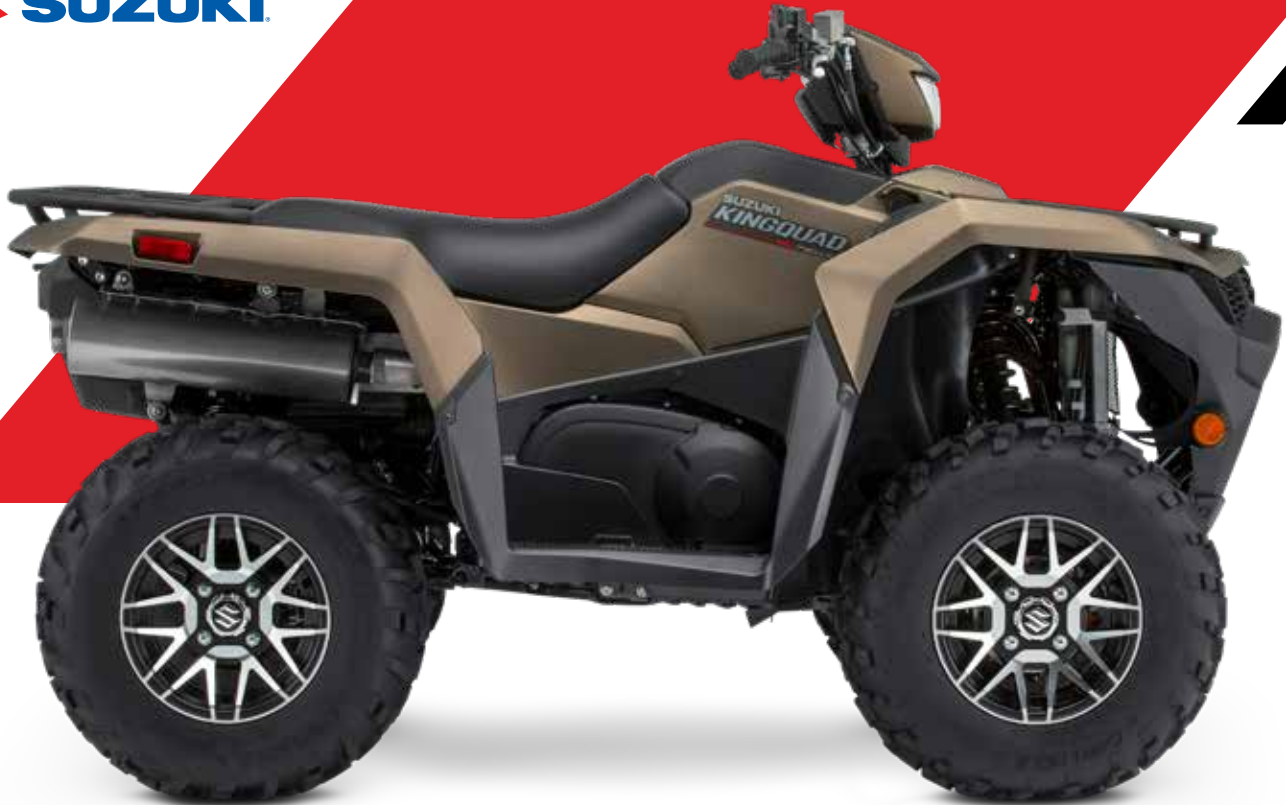
METALLIC MATTE COLORADO BRONZE (KINGQUAD 750AXI POWER STEERING SE+)