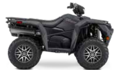
SOLID MATTE SWORD BLACK (KINGQUAD 750AXI POWER STEERING SE+)