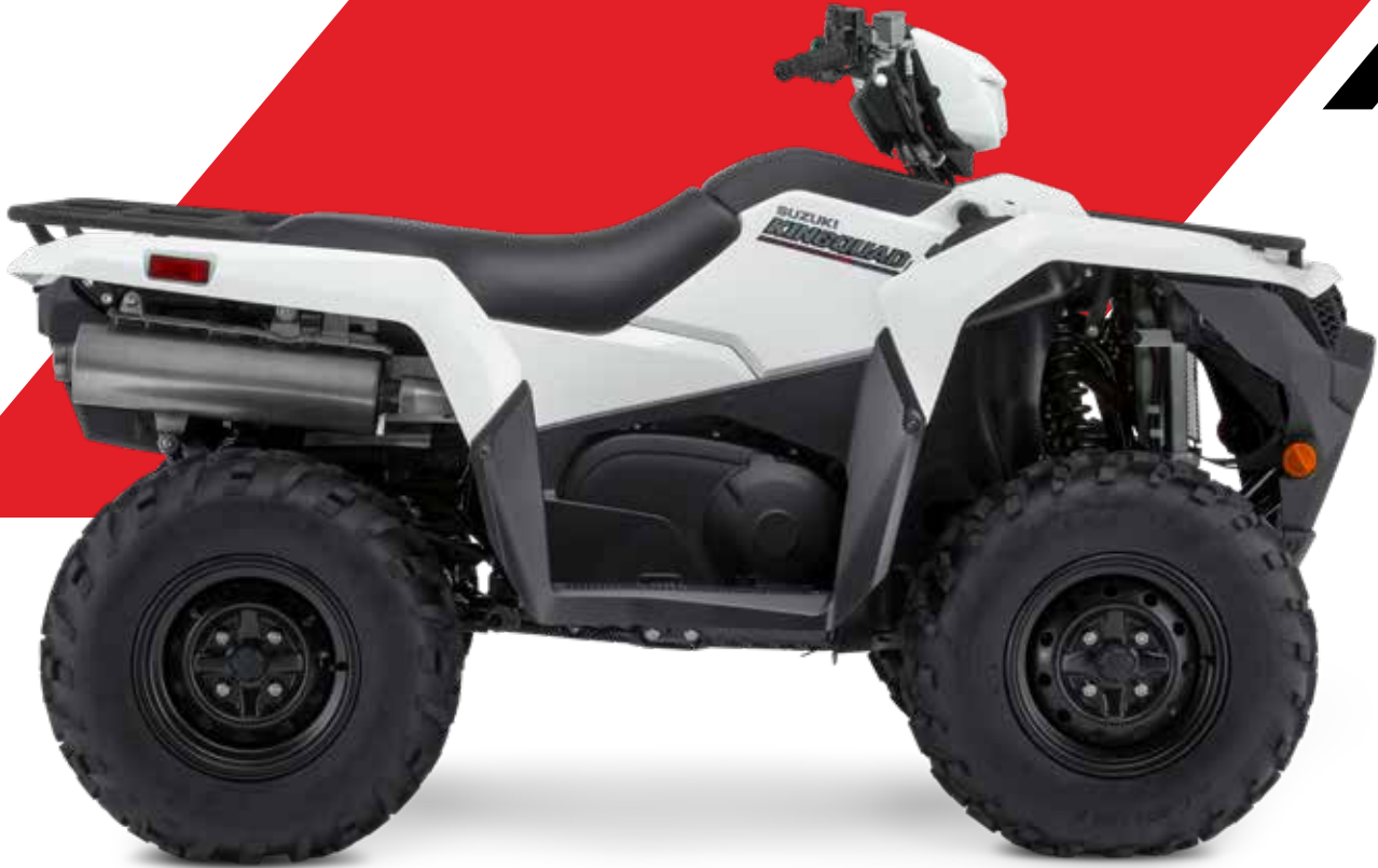
SOLID SPECIAL WHITE NO. 2