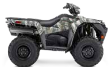
TRUE TIMBER XD3 (KINGQUAD 500AXI POWER STEERING CAMO)