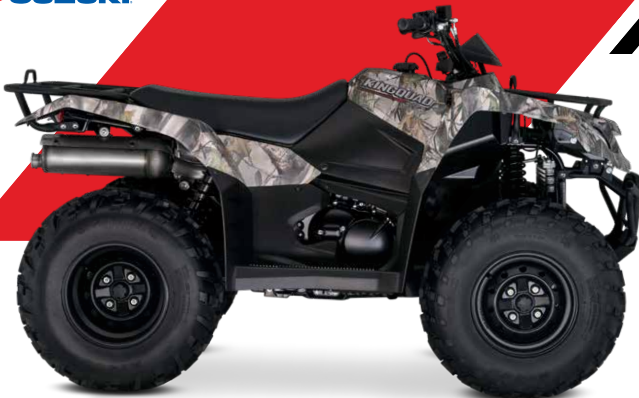
TRUE TIMBER XD3 (KINGQUAD 400FSI CAMO)