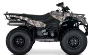
TRUE TIMBER XD3 (KINGQUAD 400ASi CAMO)