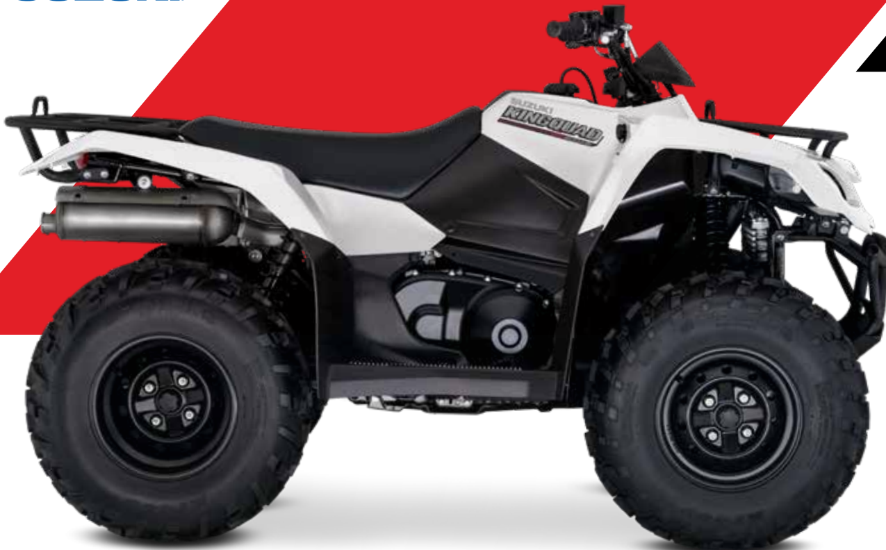
SOLID SPECIAL WHITE NO. 2