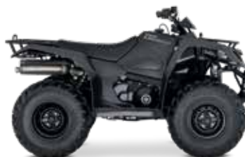
SOLID MATTE SWORD BLACK (KINGQUAD 400ASi+)